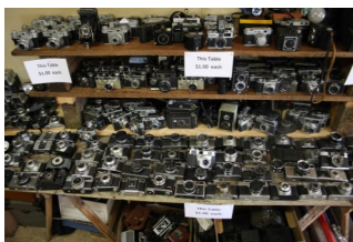
The $1.00 table of cameras waiting for you